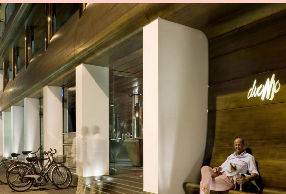
Fig 3. Hotel Duomo