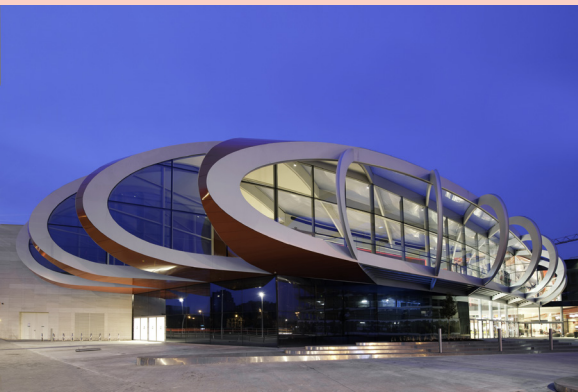
Fig 1. Mediacity, Retail Centre