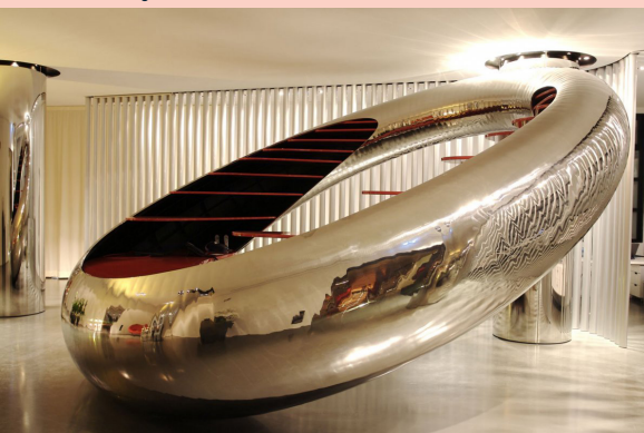
Fig 4. Hotel Duomo